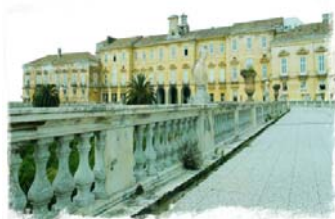
Royal Palace of Portici

The Meeting will take place in the XVIIIth century Chinese Room of the Summer Royal Palace of the Bourbon Kings of Naples in Portici, where the Faculty of Agriculture of the University of Naples Federico II is actually located ( http://www.agraria.unina.it ).